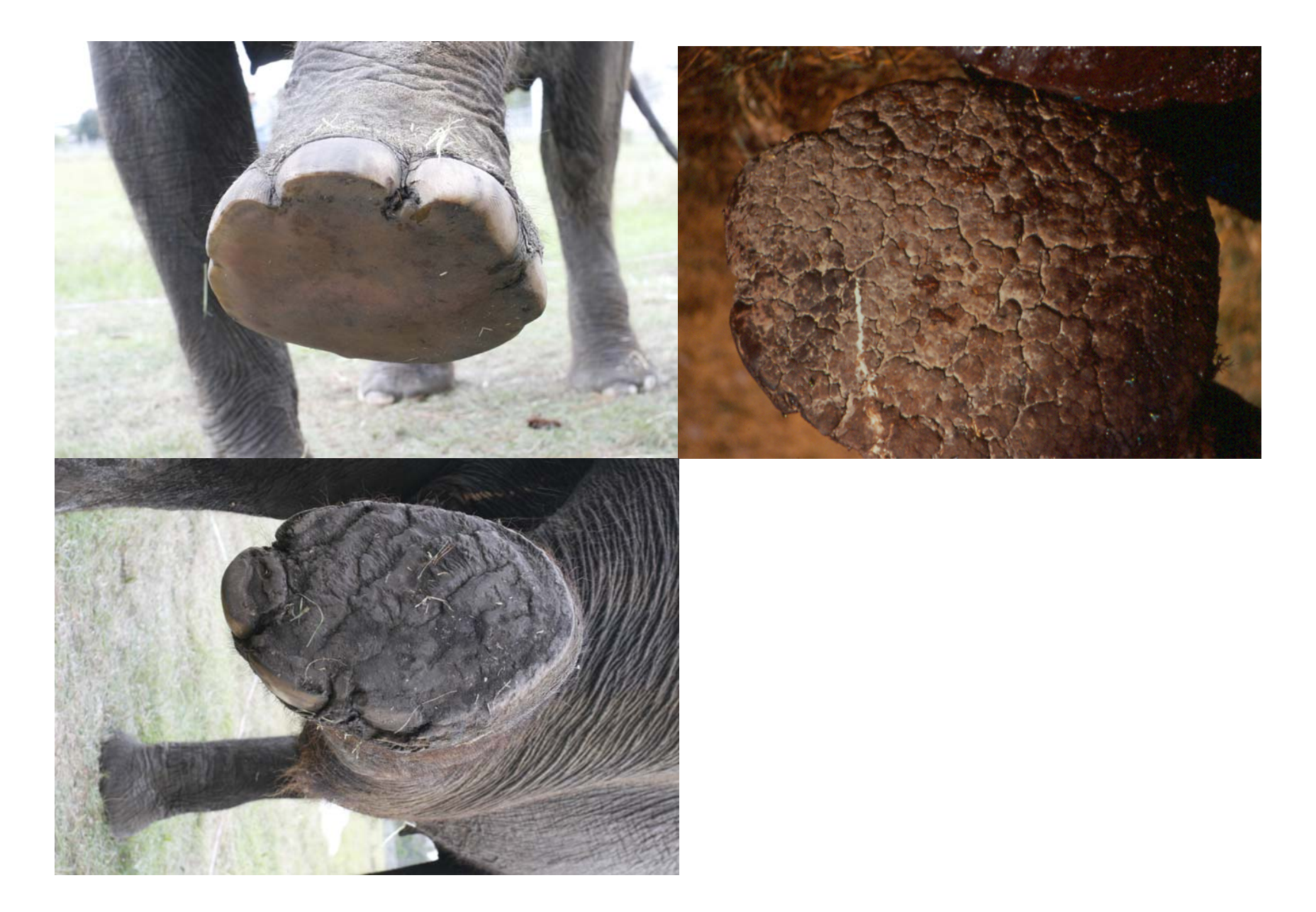
Figure 7. The unhealthy soles of the feet of Ringling Brothers' elephants (left) are either completely smooth (above) or deeply fissured (below). The healthy soles of wild elephants are evenly worn from regular use on rough surfaces, displaying a thick (2.5 cm) of sensitive skin with a distinctive wrinkle pattern, which is individually recognizable in an elephant's footprint.