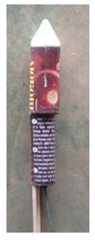
1.1. "Rocket" type firework

The price for an assortment of fireworks ranged from Kshs 30 (USD 0.40) to 100 (USD 1.33), well within financial reach of farmers in the Amboseli region.