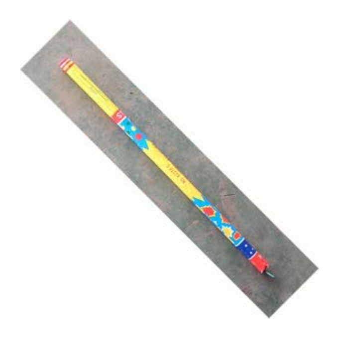
1.2. "Candle light" colored shots, ignited and directed towards elephants