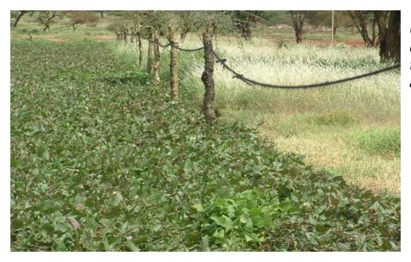
Chili-tobacco rope enclosing a bean farm to keep elephants away.

Nylon ropes (12 mm thick) are recommended since they last relatively long. Sisal ropes are, however, a cheaper substitute. In the Oloitokitok area, we used proportions of 1 kg chili and 1 kg tobacco mixed in 20 litres of used engine oil. The concoction is applied on the ropes on a weekly basis. For the supporting posts, we recommend that farmers plant trees (such as Commiphora africana ) that will root, this ensures that they don't periodically have to cut trees to replace the poles.