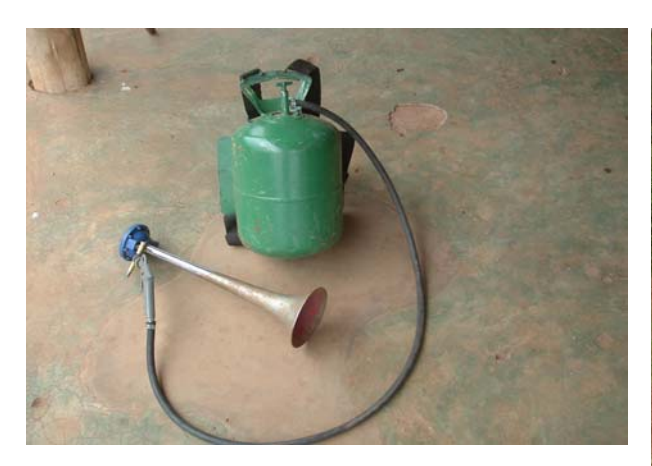
Air pressure horn used to deter elephants from crop fields.

Approx. cost for the first few pilot sound devices were Kshs 4,000 (USD 55), with the air release/handle as the most expensive part.